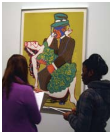
Students from Wyandanch High School use an Art Exploration Self-Study Worksheet to study Red Grooms, Mango Mango , 1973, Color silkscreen on Arches Cover paper.

The School Discovery IN MUSEUM Program, created by The Heckscher Museum of Art, provides students in grades 7-12 with a variety of art-related experiences that enhance observation skills, critical thinking and creativity. This program is ideal for students enrolled in courses ranging from Studio Art to Advanced Placement Art and Art History.