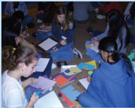
Students work on a Creative Visual Component in the Museum galleries.

An Optional Creative Visual/Written Component or Long Island's Best: Young Artists at The Heckscher Museum presentation may be added to IN MUSEUM Programs at no cost.