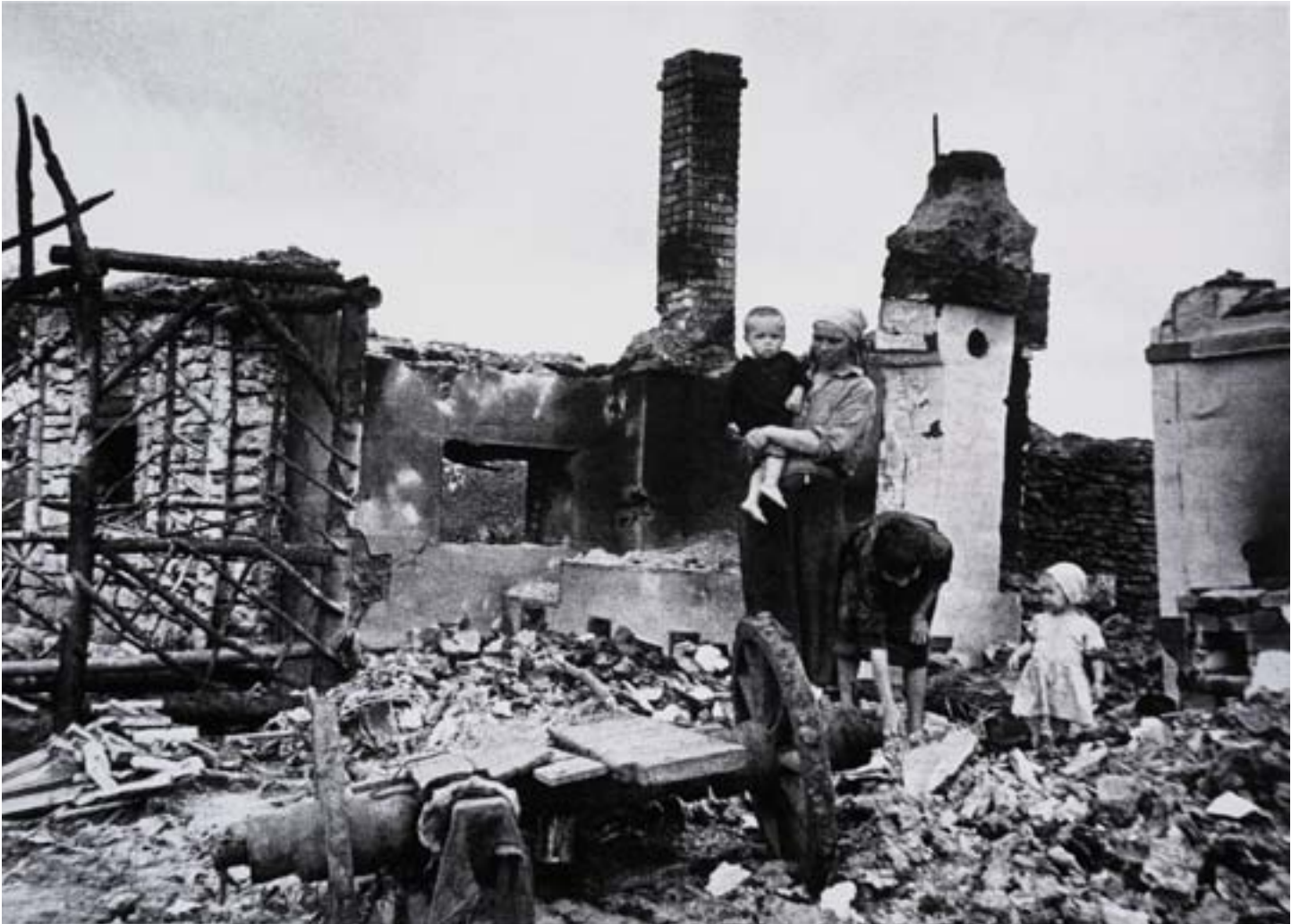
Mark Markov-Grinberg, A Mother's Anguish, Ruins of Orlov City , 1942. Heckscher Museum of Art; Gift of George and Alexandra Stephanopoulos.