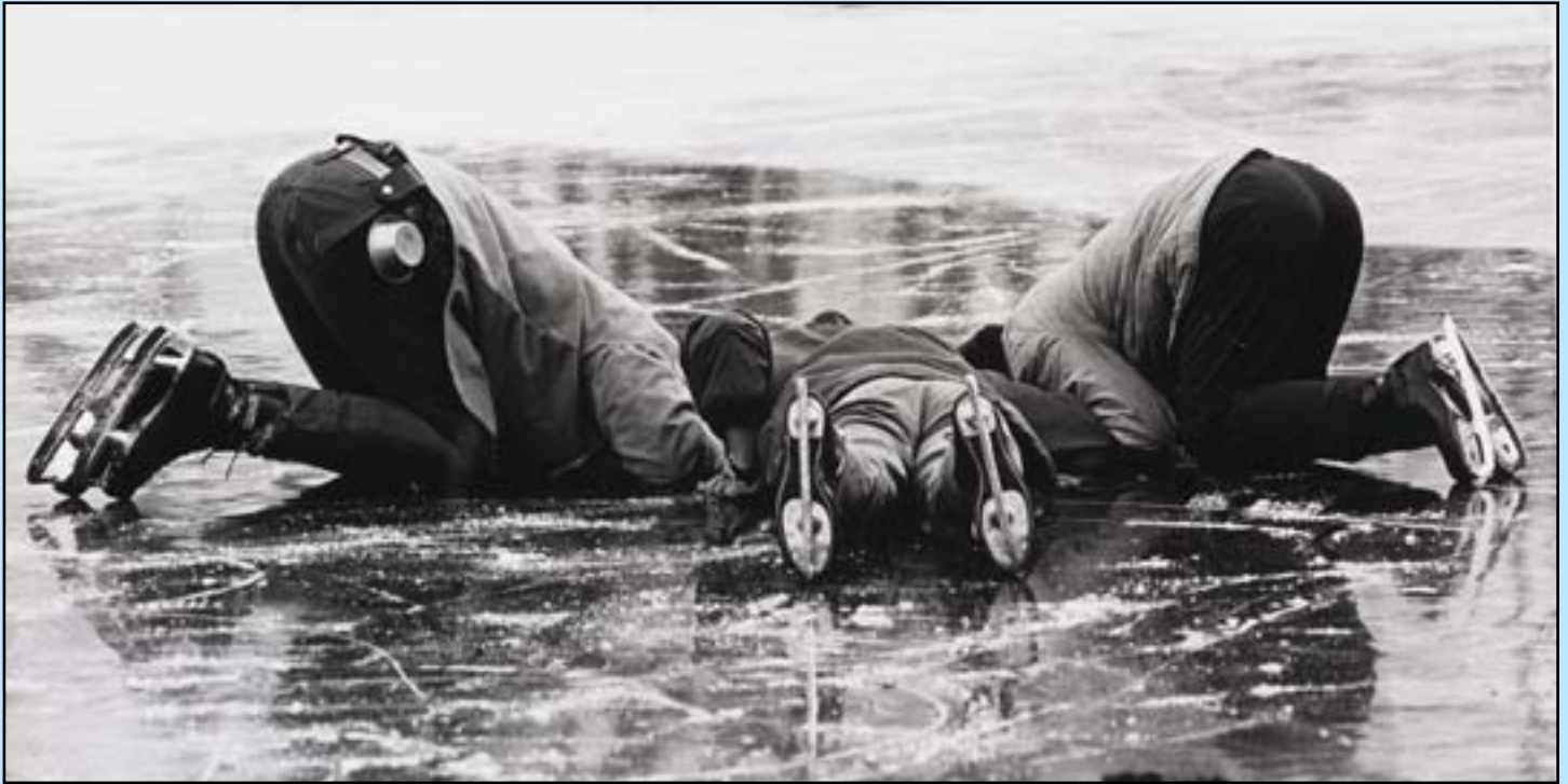
Joe Constantino, Boys on Ice , 1973 (printed 2001). Heckscher Museum of Art; Gift of the Artist.