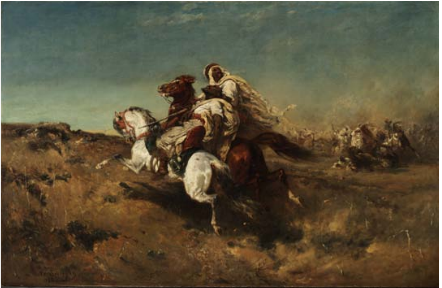
Adolf Schreyer, Arab Horsemen, Defeat and Hate , 1863. Heckscher Museum of Art; August Heckscher Collection.