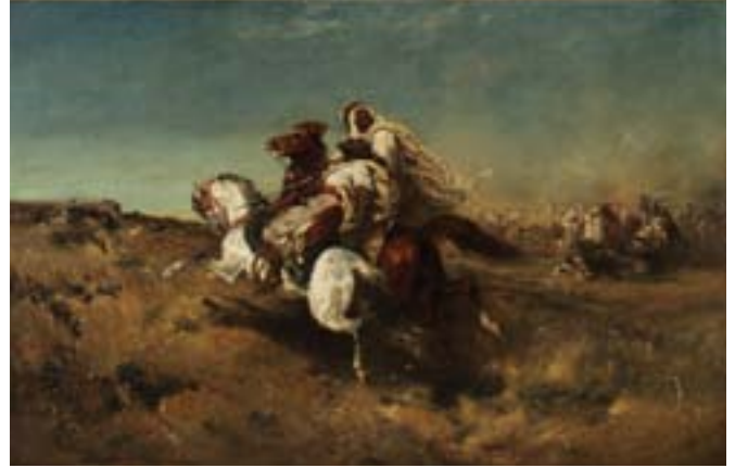
Adolf Schreyer, Arab Horsemen, Defeat and Hate , 1863. Heckscher Museum of Art; August Heckscher Collection.

Narrative art tells a story. One gallery in this exhibition displays artwork that dates from the 16th century to the early 21st century. These works depict stories from the Bible, mythology, literature, and history. The second gallery contains paintings, sculptures, works on paper, and photographs which portray a wide range of human experiences and emotions. Every work in this exhibition reminds us that a picture really is “worth a thousand words.”