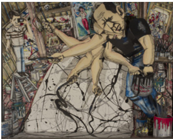
Red Grooms, Jackson in Action , 1997. 3-dimensional color lithograph on Rives BFK paper, cut out, glued and mounted in Plexiglas case. Museum Purchase 2018.2

Not only does Lisa use artwork the museum already owns, but she also finds new pieces for the museum to borrow or buy.