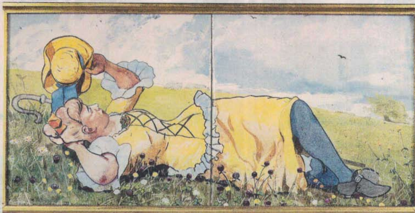
Winslow Homer's "Resting Shepherdess" of 1877 is one of the works on painted and glazed ceramic tile in the Heckscher's "Tile Club" exhibit.