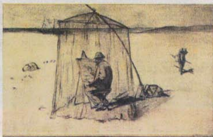
"Tile Club" includes William Merritt Chase's "A Subtle Device" (1881).